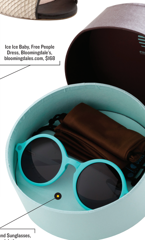
Common G-round Sunglasses, ModCloth, modcloth.com, $124.99