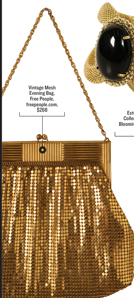
Vintage Mesh Evening Bag, Free People, freepeople.com, $268